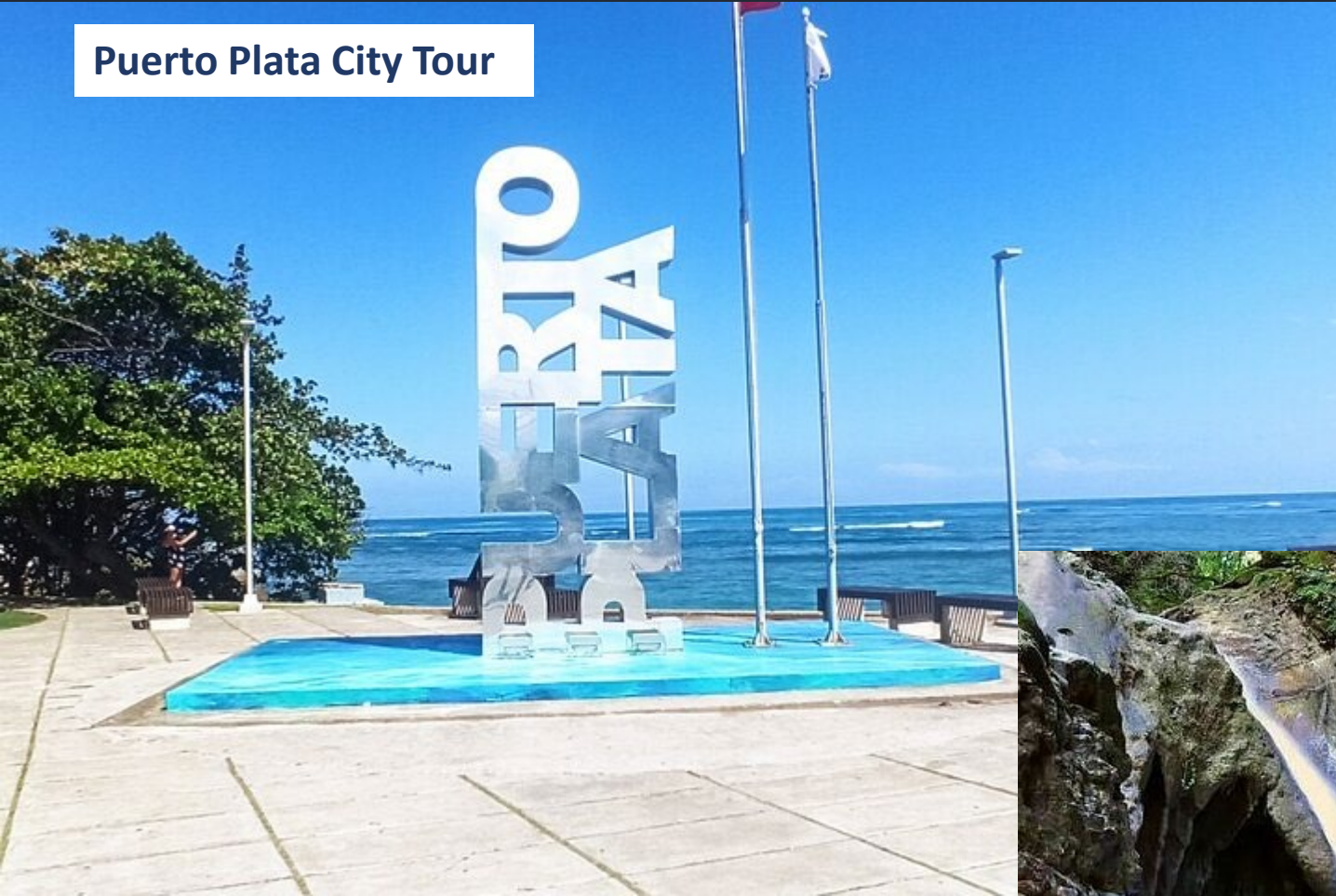
Puerto Plata City Tour